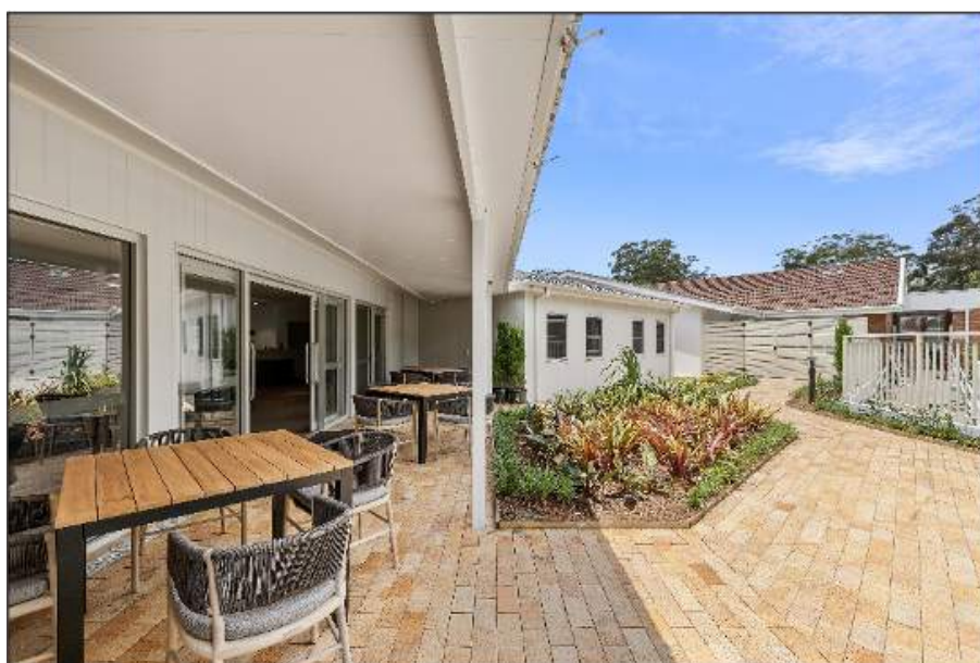
Patio and Outdoor Space at St Louise Dementia Unit