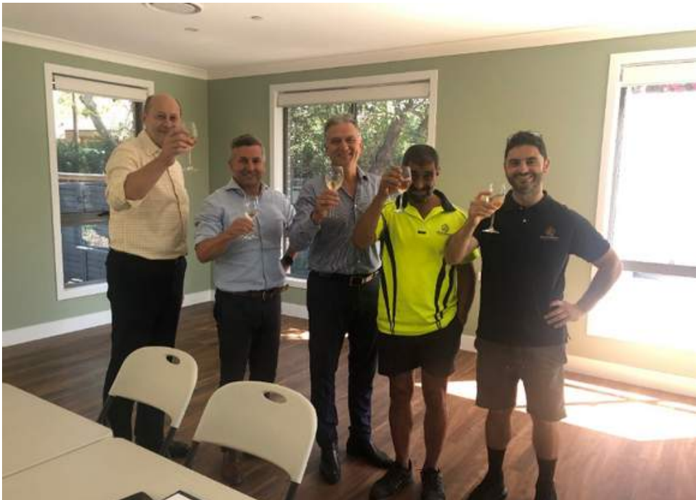
The team toasts to completing Seton's four-year Asset Redevelopment Program