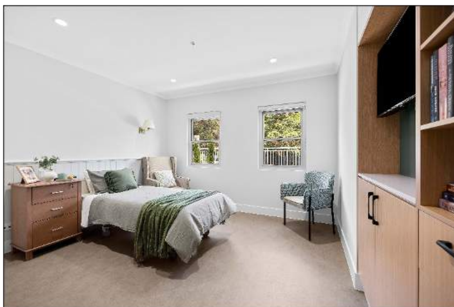
Premium Room at St Louise Dementia Unit