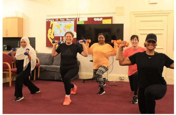
Mothers at SVFP prove that they can be 'super parents' and 'super fit' at the same time.