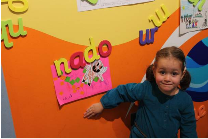
"Watching our children's faces light up as they proudly presented their artwork was a heart-warming experience."