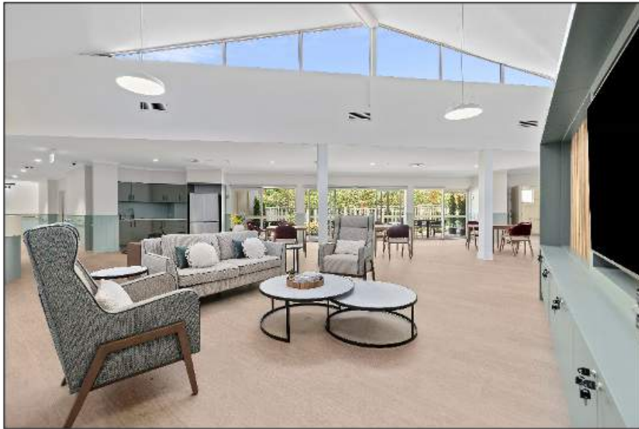
Lounge and Dining Area at St Louise Dementia Unit