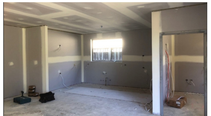
Dover Street property