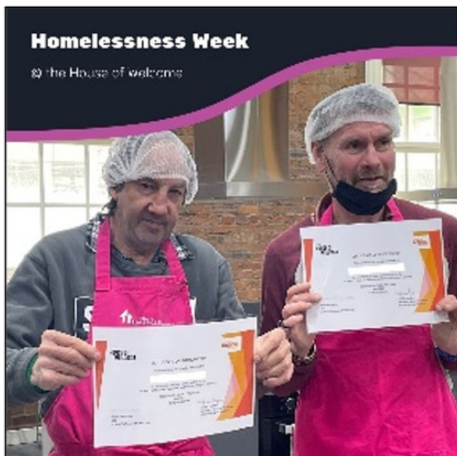
Two of our wonderful service users receiving their cooking certificate. They have just re-enrolled for the next course!

We are very excited to have started a new program in our Training kitchen with William Angliss Institute to take our service users through a 10-week certificate program in food safety, meal preparation and take their home cooked items with them to enjoy later, including chicken parmigiana, vegetarian lasagne and blueberry pies. The kitchen was built with the generosity of the Daughters of Charity gift funds.