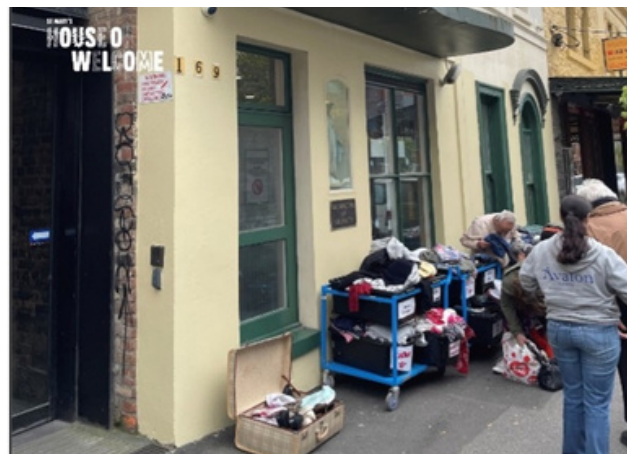
Avalon clothing shares new clothes at a market each month.