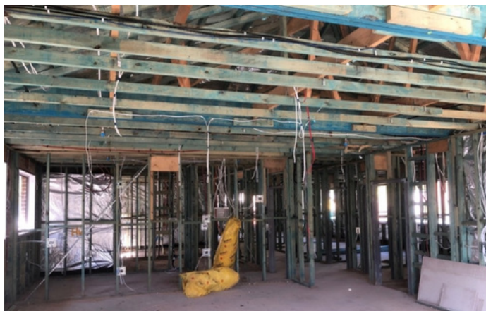
Koorong Street property