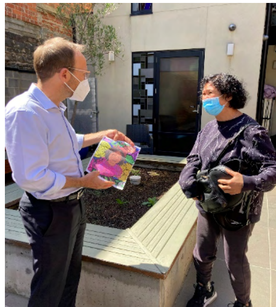
Federal MP Adam Bandt talking in our courtyard with one of our art class members.