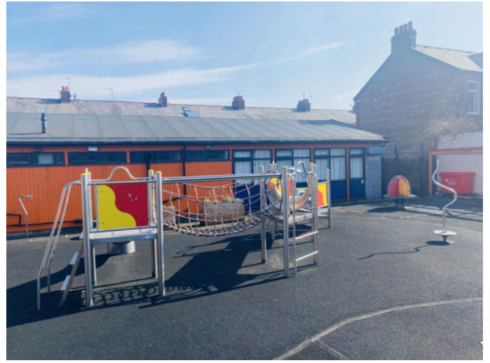
Out There Family Centre before and after renovations